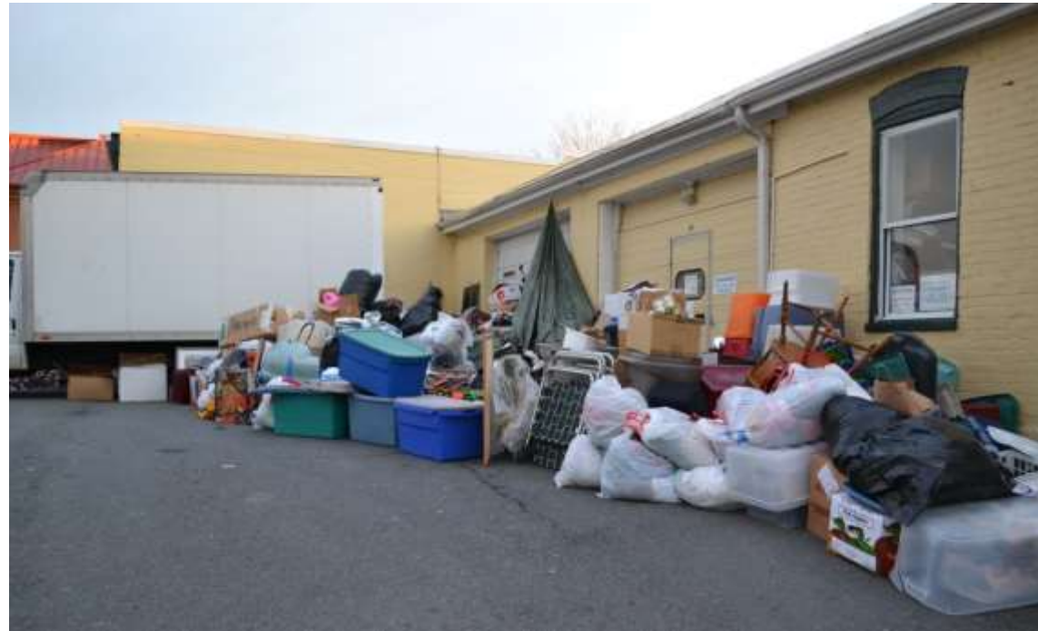
The Closet of the Greater Herndon Area, Inc.

Please see our website for what items we accept www.theclosetofgreaterherndon.org