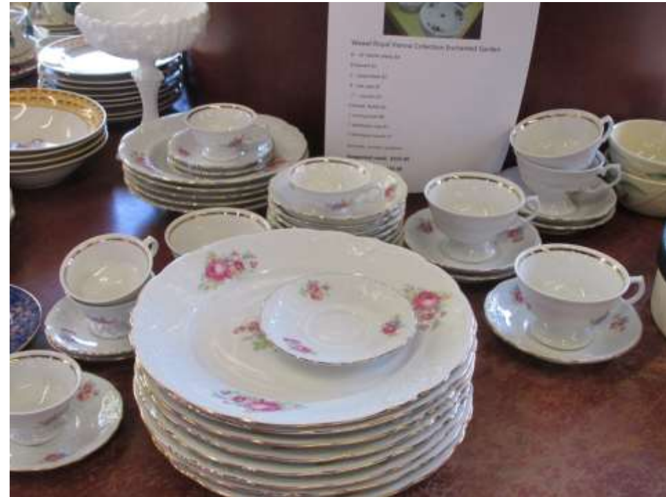
The Closet of the Greater Herndon Area, Inc.