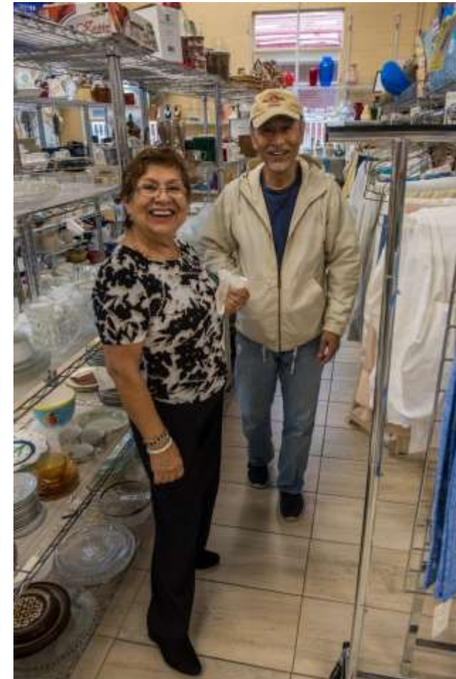
The Closet of the Greater Herndon Area, Inc.